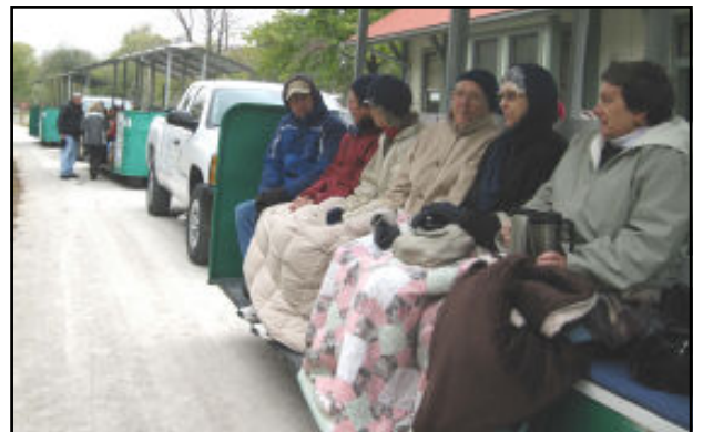
The Roamin’ Catholics loaded onto the trams, ready to begin the two hour tour.

As it happens, the third Wednesday of October, the very date of the Roamin’ Catholics trail ride, had been duly named Missouri Day by the leaders in Jefferson City. So a little Missouri trivia was in order. How many famous people from Missouri can you name? Most are aware of Harry Truman, Samuel Clemens (Mark Twain), Walt Disney, Omar Bradley, Thomas Hart Benton, and George Caleb Bingham. But did you know Missouri was also the home of George Washington Carver, Ginger Rodgers, Betty Grable, Walter Cronkite, J. C. Penney, and Marlin Perkins? There are more, and even some such as Brad Pitt, who would be recognized by the younger crowd. It’s amazing the number of Missourians who have become quite renowned in their fields of endeavor.