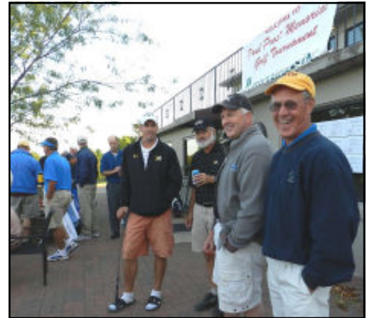
It was a beautiful day for golf, with plenty of time for food, drink, and socializing.