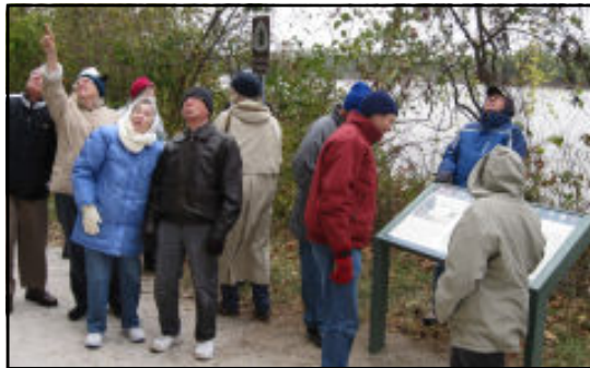
One of the stops allowed riders to see red petroglyph markings on the bluff wall, left many years ago.

ron.meyer9@yahoo.com and colleenmarie72@yahoo.com .