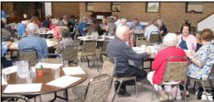
Along with the Mass of Anointing, a luncheon is served to those attending.