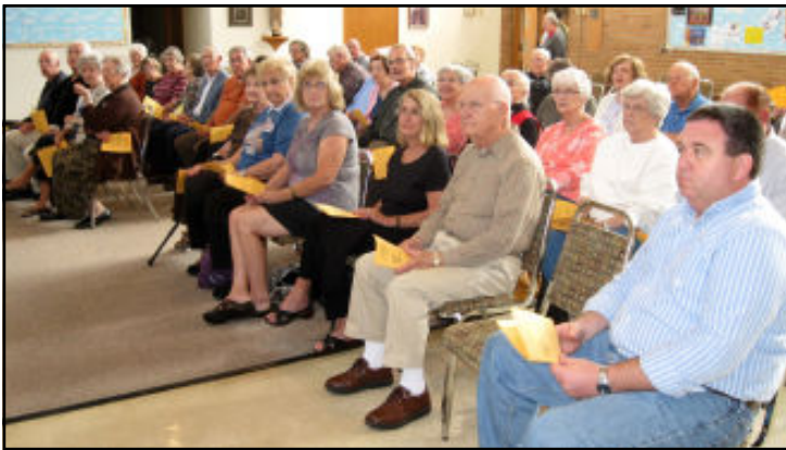
Parishioners gathered for the Mass of Anointing held at Sacred Heart Wednesday, Sept. 28, 2011.